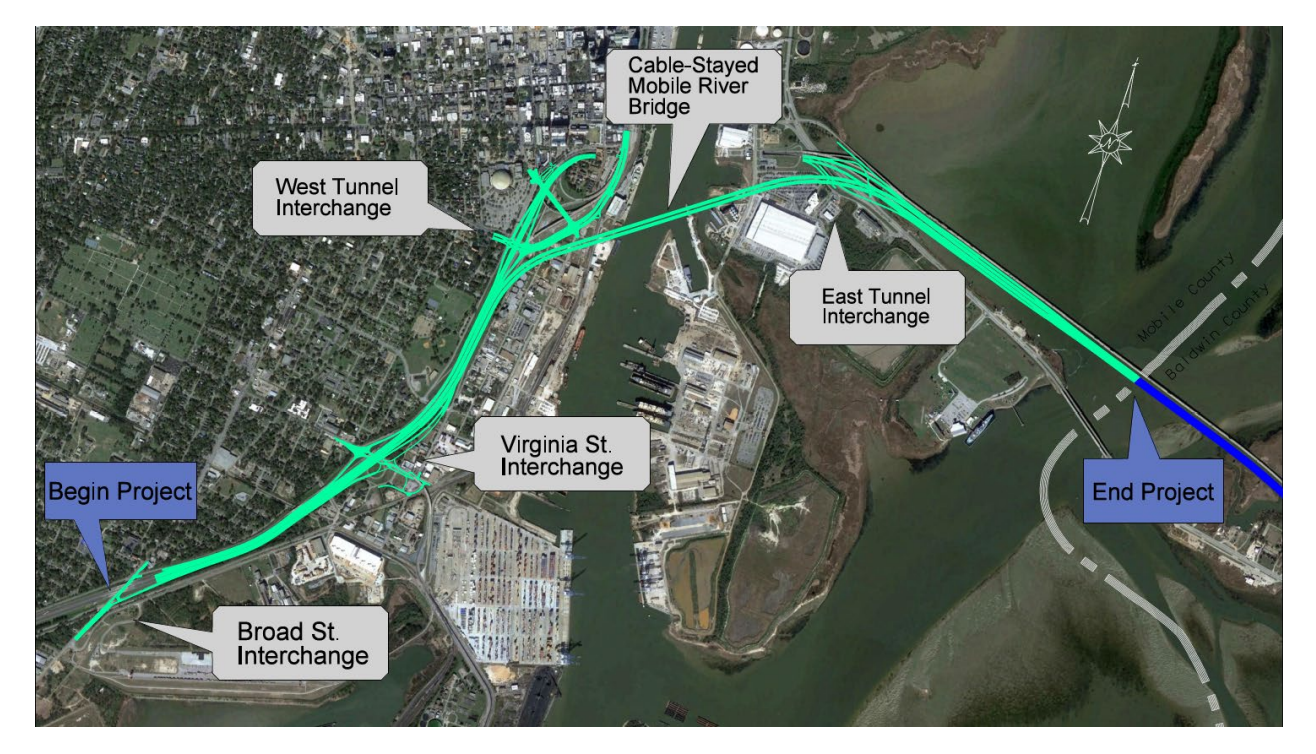
Figure 1: The Project

Alabama Department of Transportation I-10 Mobile River Bridge Design-Build Project December 7, 2022